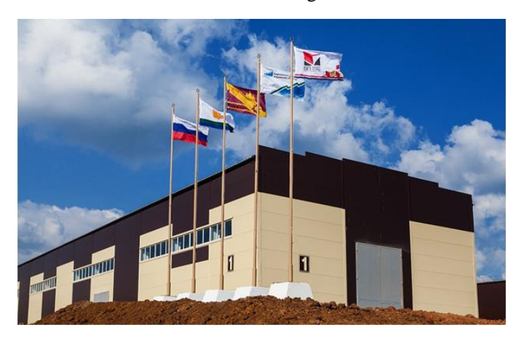
Production buildings, motor access road