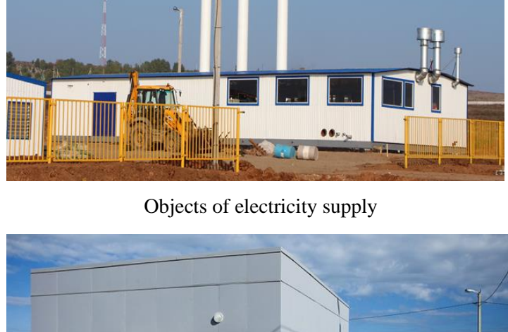
Objects of water supply (water treatment plant)